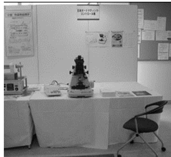
(b) Example of booth layout

Fig. Planned exhibition booth (Note: specifications of booth may be a bit changed)